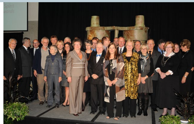
Twelve years of Spirit Award recipients at the 2010 ceremony.